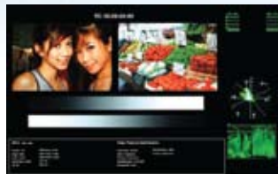
Waveform + Vector Scope + VPID SDI-1, Waveform / Vectorscope, 16 CH Audio Level Meter, VPID & Time Code