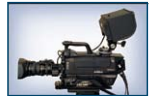
PBM-209-3G top of a Camera