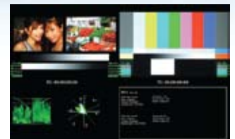
Dual 3 Gb/s Input Display Mode SDI-1, SDI-2, Waveform / Vectorscope, 16 CH Audio Level Meter, VPID & Time Code