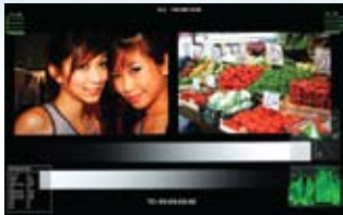
Waveform + Vector Scope Transparency SDI-1, Waveform / Vectorscope, 16 CH Audio Level Meter & Time Code