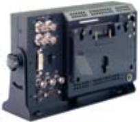
with Anton Bauer Mount