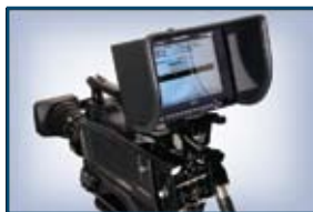
PBM-307-3G top of a Camera