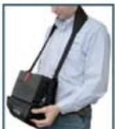
Custom Hood Handle