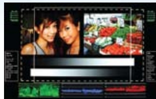
Advanced Waveform + VPID + Marker SDI-1, Waveform, (Y,Cr,Cb), 16 CH Audio Level Meter, VPID & Marker