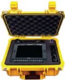
Hard Carry Case